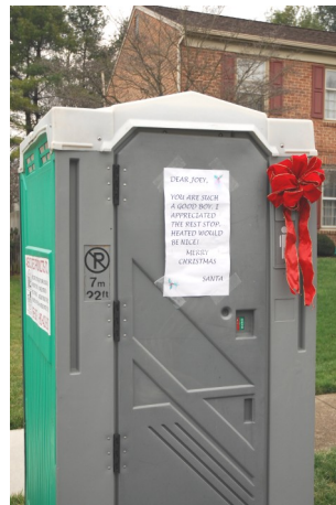
◀The porta potty in question

dictate that porta potties be displayed only for special events, such as major construction projects. This would be appropriate as it does wonders to save the existing bushes.