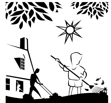
Westover Community Pride

All you need to do is show up with leaf rakes, and/or hedge trimmers, and gloves on May 10th at 9:00 am at the McCord Commons for your assignment. You can email us at westover@villageofwestover.org to let us know if you are able to help.